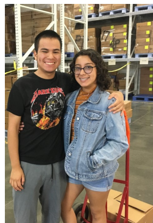
Happy customers buying boxes of books!